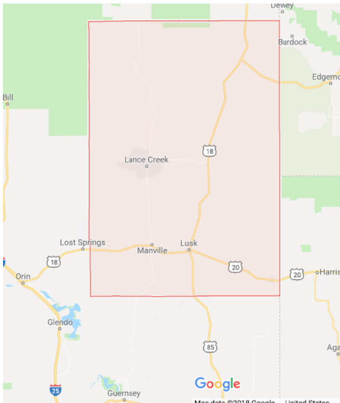
Regional Map – Niobrara County